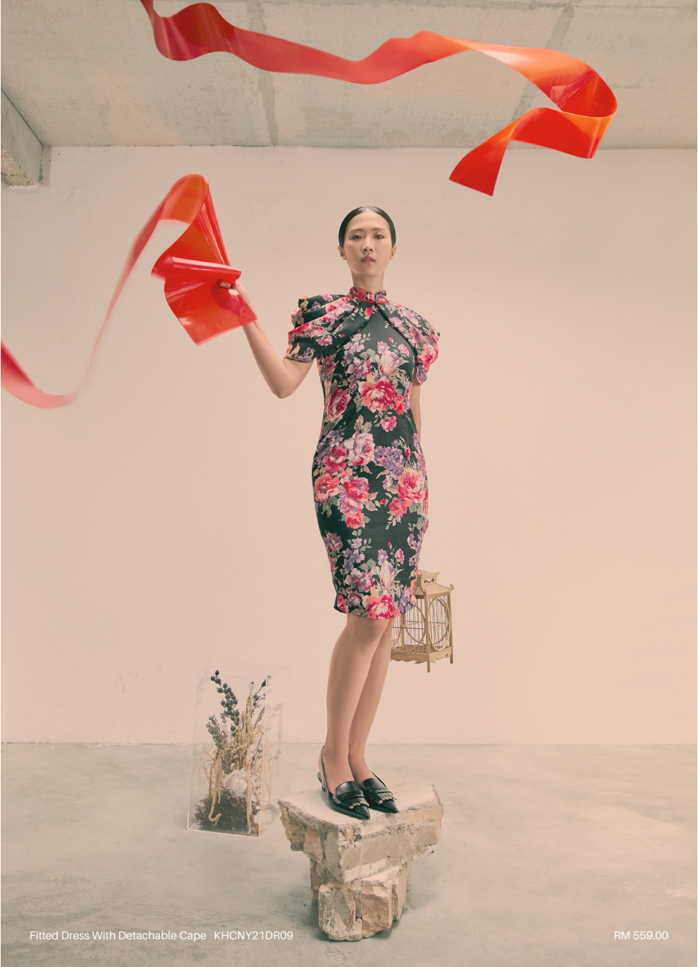
Fitted Dress With Detachable Cape KHCNY21DR09