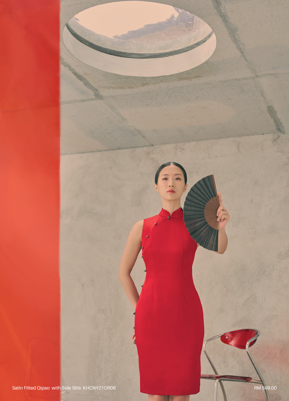
Satin Fitted Qipao with Side Slits KHCNY21DR08